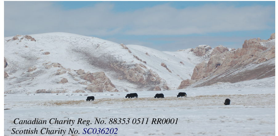
Canadian Charity Reg. No. 88353 0511 RR0001 Scottish Charity No. SC036202