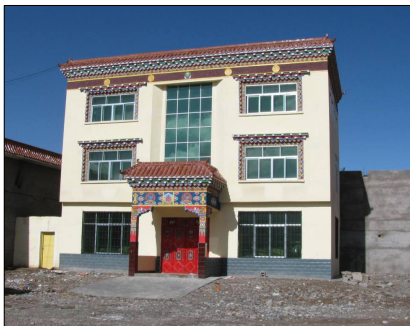
Completed hospital building Zaduo

In Zaduo PP has assisted with the construction of a new building for the hospital where over 60% of patients in the town are seen. The four new community health centres in Zaduo are near completion. A doctor training, to increase the standard of care in these facilities, is now planned for the end of the year. The clinics are built in remote communities who are very supportive of these new facilities.